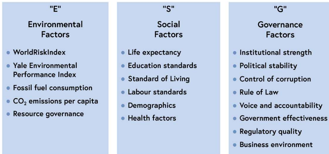
Figure 2: Diverse Range of Quantitative and Qualitative ESG factors